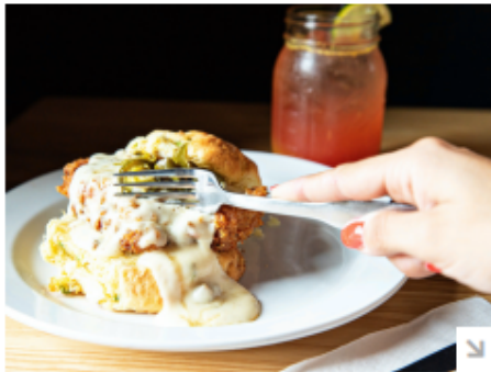
A signature menu item at Vicious Biscuit is the Vicious, a cheddar and jalapeno biscuit featuring a fried chicken breast and maple sausage gravy.

Initially intrigued by Vicious Biscuit as a restaurant name when the concept launched six years ago in South Carolina, Indianapolis-based entrepreneur Steve Wise plans to open 10 locations of the breakfast and brunch eatery in central Indiana.